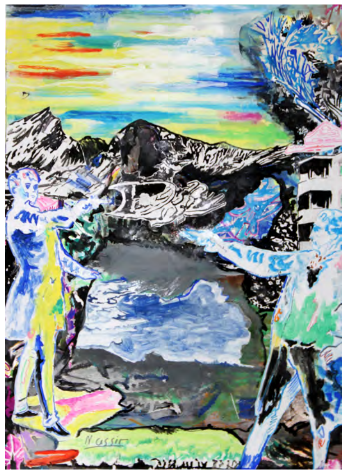
Untitled, 2013, acrylic on paper, 100x70cm. Courtesy of artist.

movement), Nassir's paintings prefer a less aggressive but more melancholic and philosophical approach and are not bent on intimidating the viewer with their visual might. Such a quality is shared by many other Iranian modern artists of the same generation established outside Iran whose works enjoy a milder tone in comparison to their western counterparts. The works of Ali Nassir are prouder than to focus on impressing their viewers. They are painted without thinking of the viewer and do not hide this. In their technique and the way in which colors are applied, they come in times close to Kandinsky's Blue Rider period, yet distance themselves from him in their opposition to any sort of "Spirituality in Art". The works of Ali Nassir show an introversion which is expressed through taking his figures to the open air, through putting them on stage