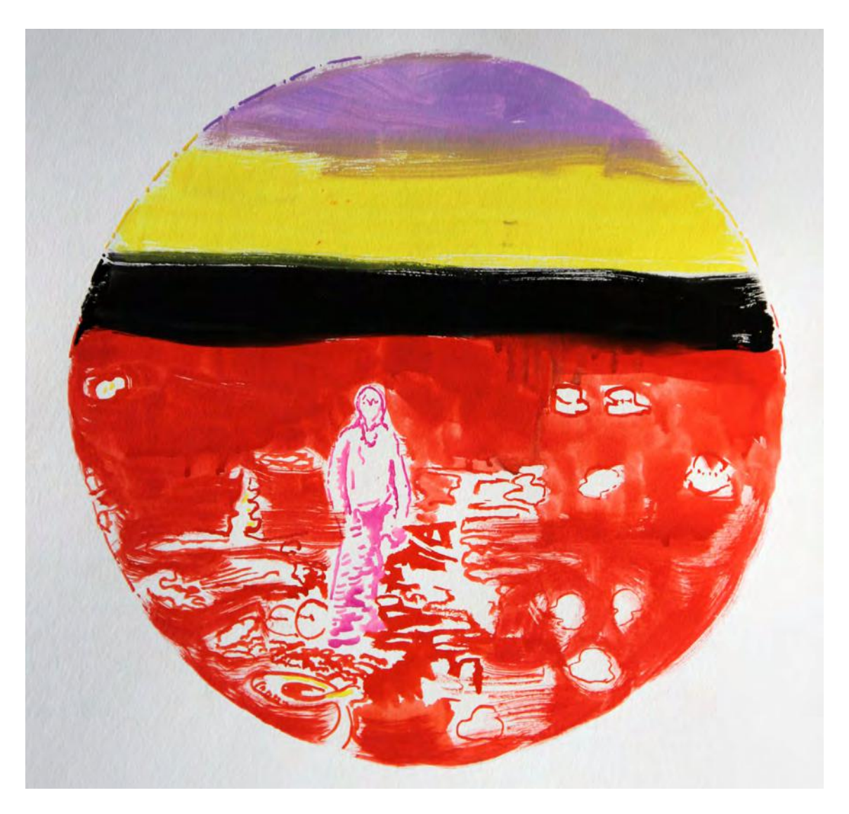
Untitled, 2011, ink on paper, 100x100cm.

"A schizophrenic out for a walk is a better model than a neurotic lying on the analyst's couch," write Deleuze and Guattari in the opening pages of Anti-Oedipus before bringing in an example from a novella, Lenz. The figures of Ali Nassir's paintings seem to take up the advice and follow this "better model." In the purely subjective world of these paintings—which would pass for abstract